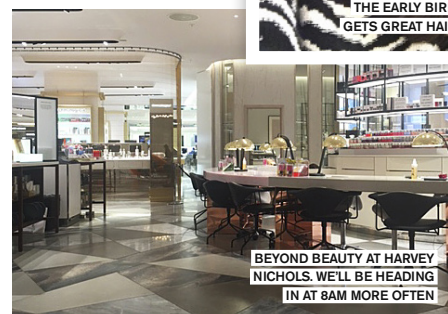
BEYOND BEAUTY AT HARVEY NICHOLS. WE'LL BE HEADING IN AT 8AM MORE OFTEN