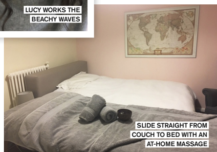
SLIDE STRAIGHT FROM COUCH TO BED WITH AN AT-HOME MASSAGE