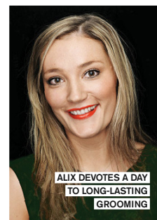
ALIX DEVOTES A DAY TO LONG-LASTING GROOMING

But George Northwood's cuts are targeted at the most low maintenance of people and are not only simple to style, but can last up to five months. The key? Keep the ends blunt as layered ends need more regular upkeep. Therefore, as your hair grows, the style will keep its shape for longer. I head over to the salon and after a lovely consultation with Dario, followed by an amazing head massage, cut and signature 'undone' George Northwood blow-dry, I'm out the door within an hour. From £75, george northwood.com